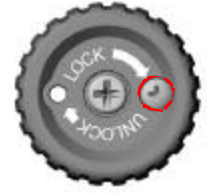
LOCKED Fine Adjustment Tension Knob

Settings: For the MK9SST, settings range from (STD 1-4), and (HVY 5-8).