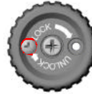
UNLOCKED Factory setting

TENSION ADJUSTMENT LOCK - Move screw to desired position